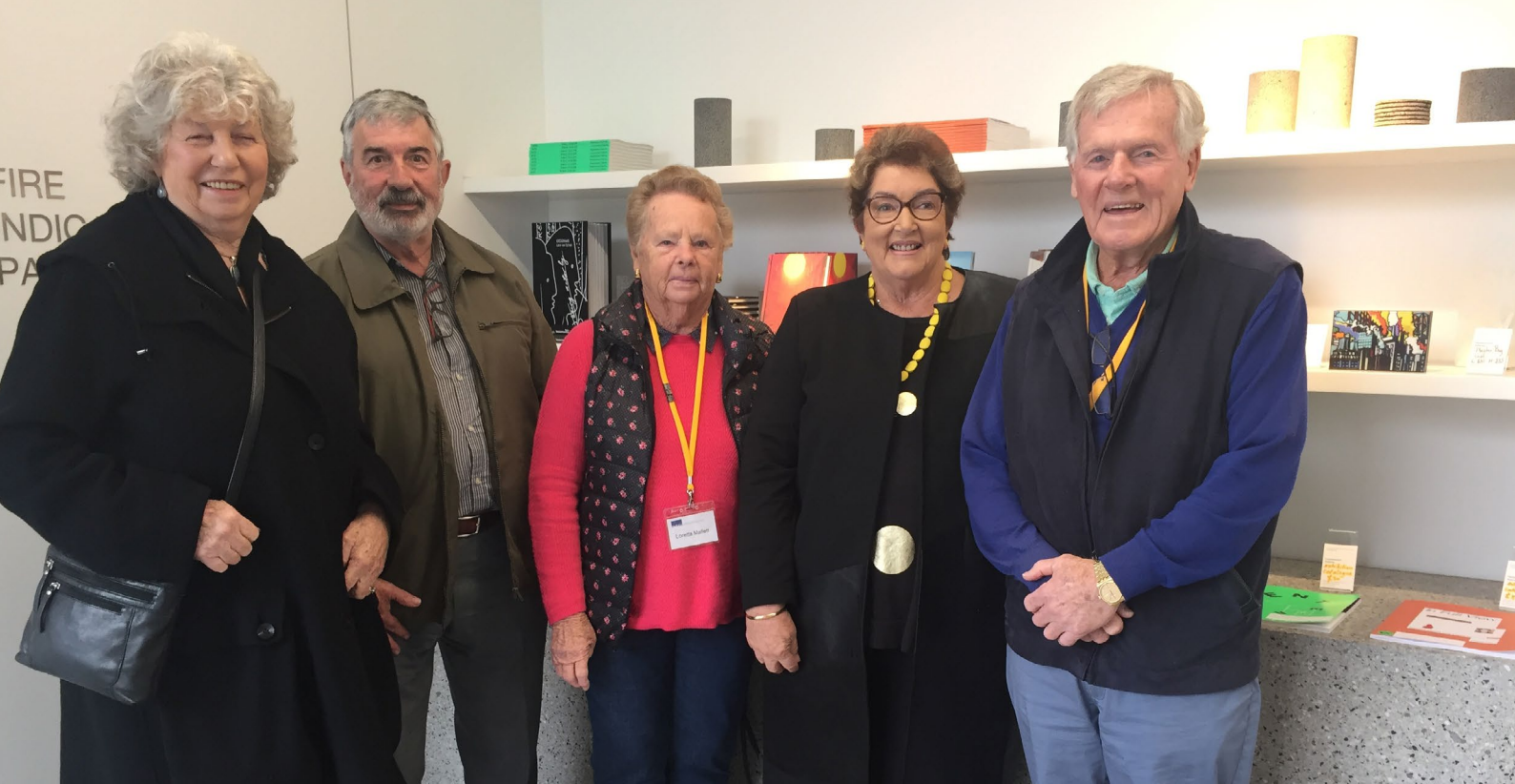
ADFAS Mornington Peninsula members enjoy a recent visit to the Lyon House Galleries in Kew