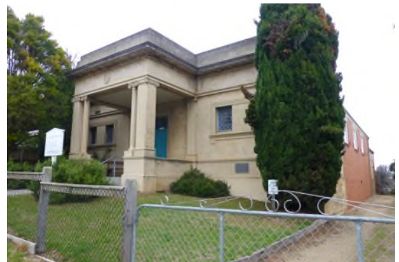
Figure 3 Masonic Temple, Sorrento