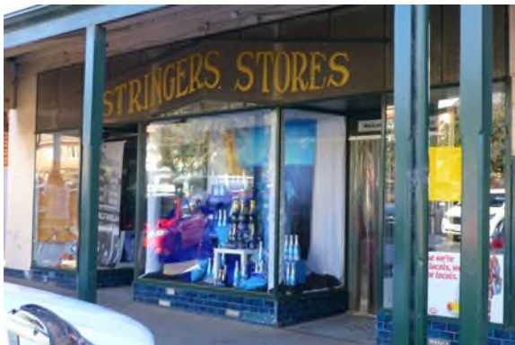
Figure 2 Stringers Stores, Sorrento

Once the citations have been adopted by Council, the citations will be entered into the HERMES database, administered by Heritage Victoria. The PPN1 states that all statements of significance should be securely stored in the HERMES heritage database.