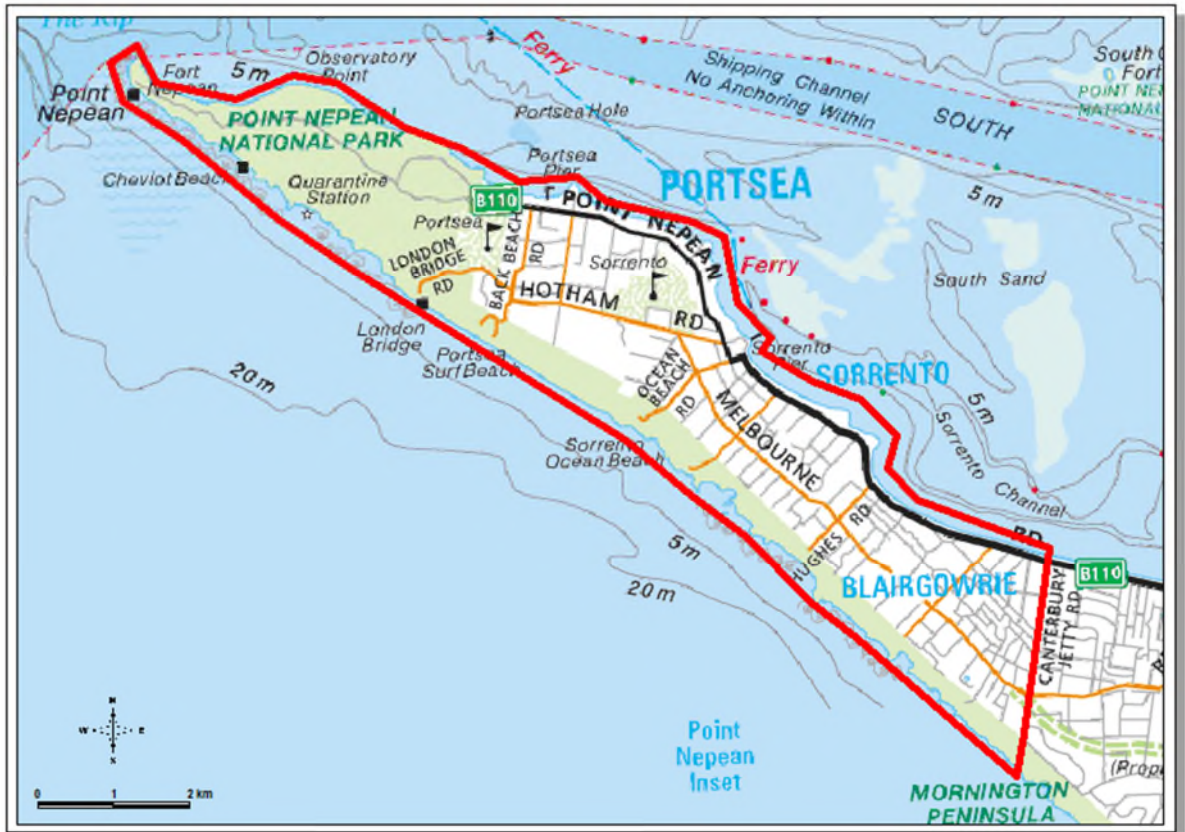
Area 3, comprising the suburbs of Blairgowrie, Sorrento and Portsea.