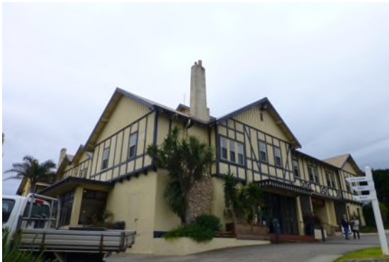
Figure 6 Portsea Hotel, Portsea