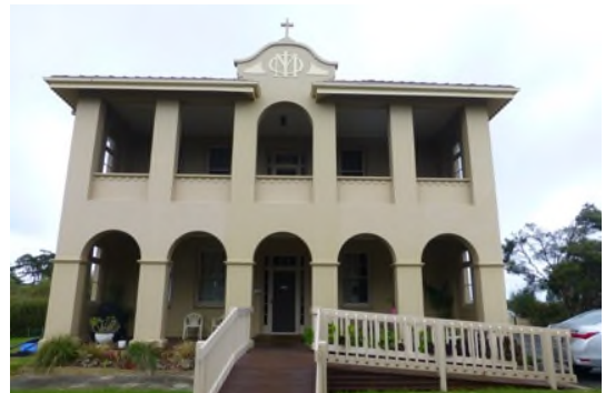
Figure 5 St Mary's Presbytery, Sorrento