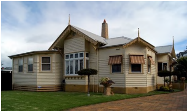
Figure 4 Dalwhinnie, Sorrento

This review and its recommendations should be reflected in the development of new overlays and local policy and Volume 1 of this Review be included in the planning scheme as a background document (previously called reference documents). Volume 3 of this Review is a compilation of all Statements of Significance at the date of adoption. The individual Statement of Significance documents will become incorporated documents in line with PPN1.