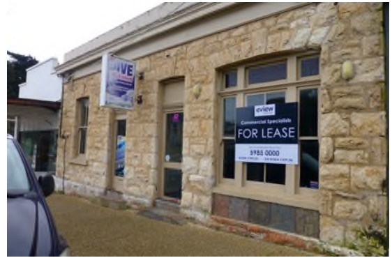
Figure 7 Limestone shopfront, Portsea