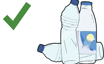
Plastic bottles (lids on*)

*Loose lids less than 5cm in diameter will not be recycled