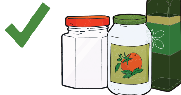
Glass bottles and jars (lids on*)