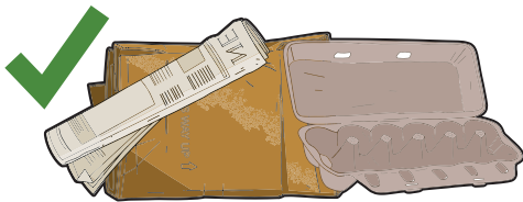
Paper, cardboard, newspaper and magazines

Just one contaminated bin can send a whole truck load to landfill. Please ONLY place empty recyclable items in your recycling bin.