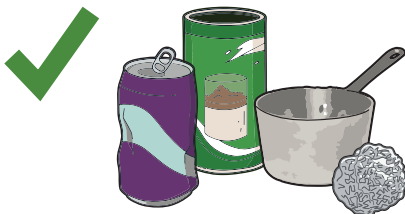
Aluminium and steel cans, trays, aerosols, pots and pans Scrunch foil into a ball