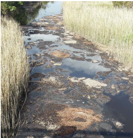
Merricks Creek late in 2015