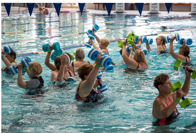
Pelican Park - Hastings

There are 45,980 people over the age of 65 years old living in the Mornington Peninsula Shire, 6,029 of them are over the age of 85 years old. The Mornington Peninsula has a greater number of people over the age of 65 than Greater Melbourne. Research indicates most adults over the age of 55 years are healthy and well educated. Life expectancy is expected to continue to improve for males and females highlighting the anticipated growth in our older population. Planning for positive aging will be essential element to support the community.