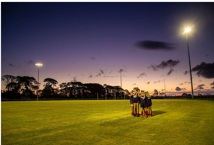
Emil Madsen Reserve

At an individual perspective these community characteristics contribute to and can also improve an individual's physical and mental health and positive outlook, reducing stress, anxiety, and depression.