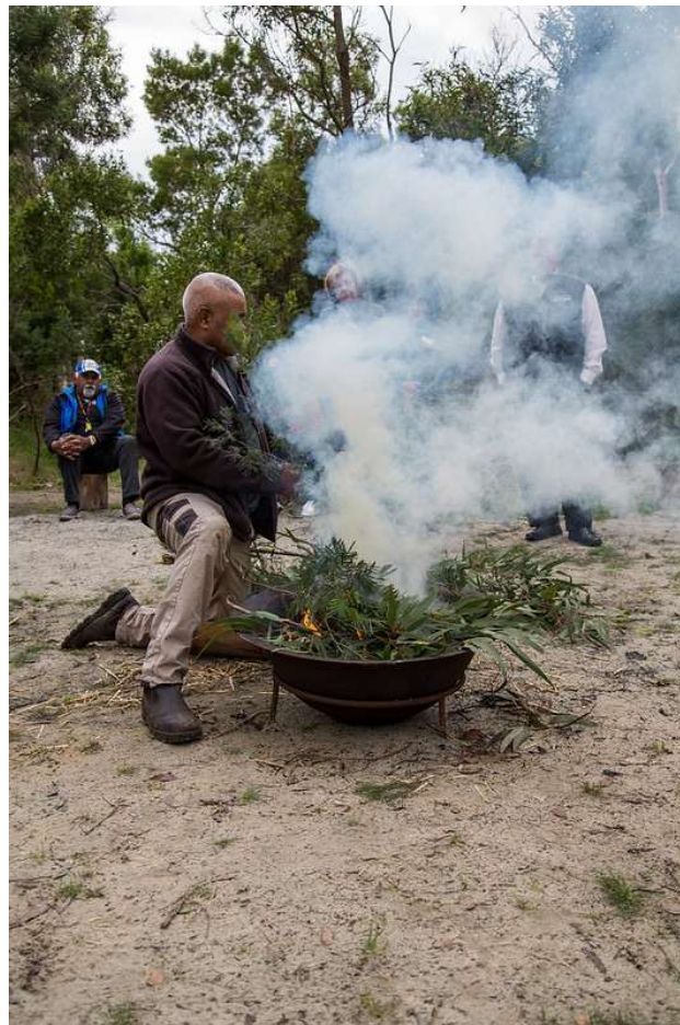
Smoking Ceremony at Willum Warrain

These attributes build strength and resilience. In the face of a set-back or new challenge, resilience better enables individuals and communities to understand the challenges and how to respond best and accept and receive support when needed.