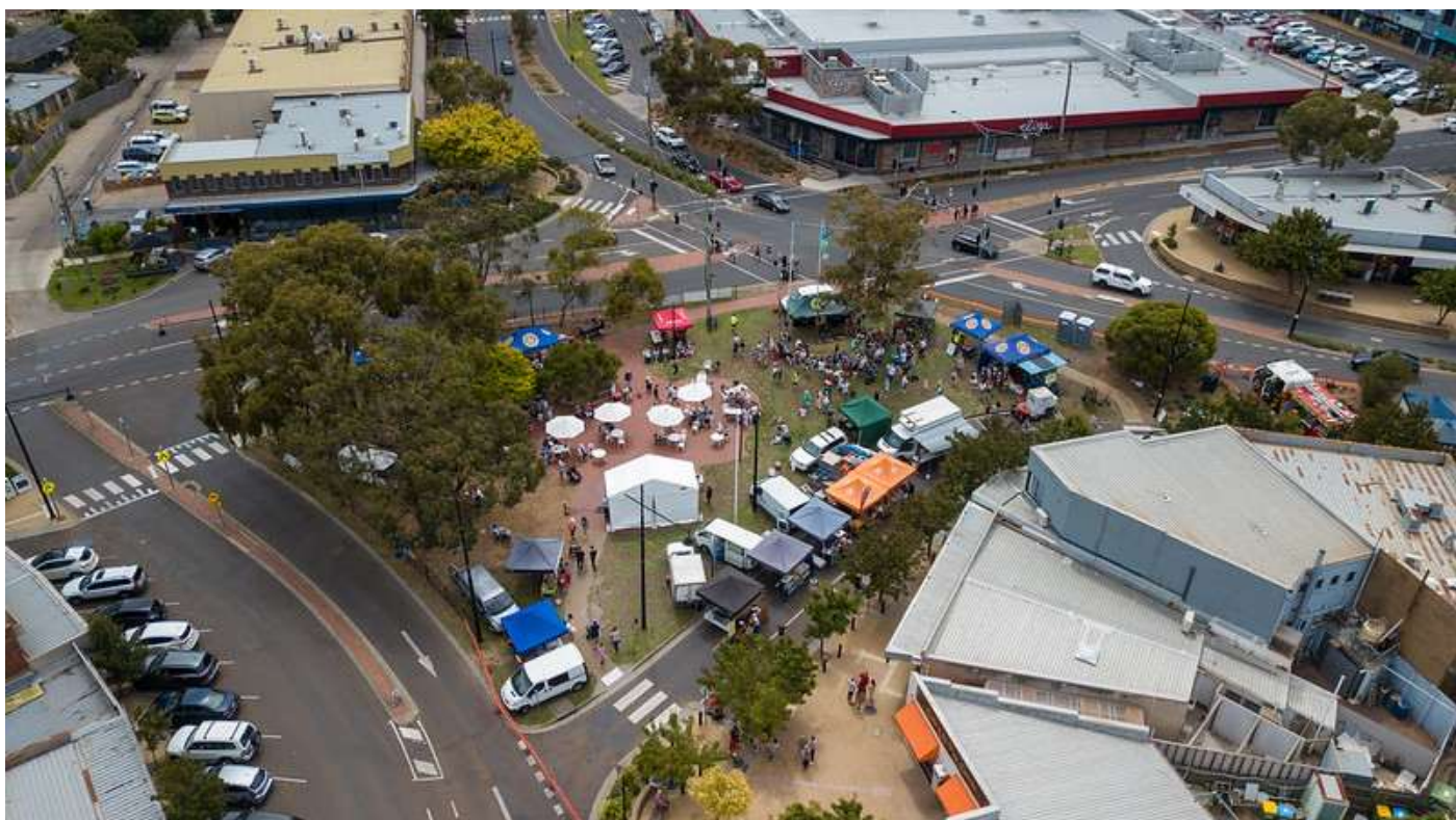
Aerial image of Mt Eliza market

Residents enjoy townships with a semi-rural and coastal character and lifestyle and is keenly sought to continue. They have previously expressed their concern about high density housing in the context of the need for balancing increased housing demand and business growth with the retention of the charm and appeal of a local areas. Much of the charm and appeal is in the open space and coastline environments is further discussed in Environmental Sustainability (overleaf)