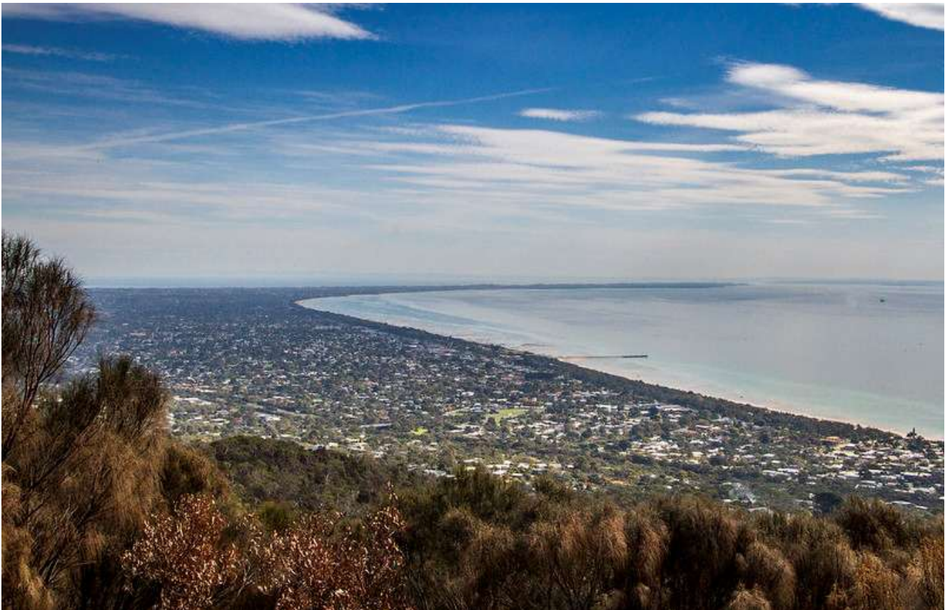
Port Phillip Bay image taken from Arthur's Seat