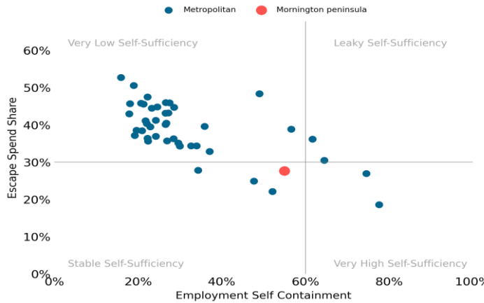
The Commuter Effect Escape Spend and Commuting

Compared with other Metropolitan councils, in Mornington Peninsula: