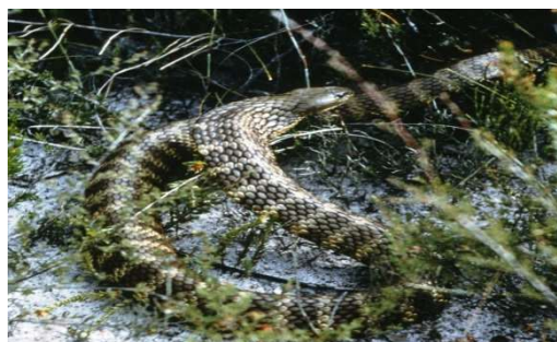
Figure 3. Tiger Snake

Snakes are protected under the Wildlife Act 1975 . Do not attempt to kill a snake; it is illegal and you are more likely to get hurt.