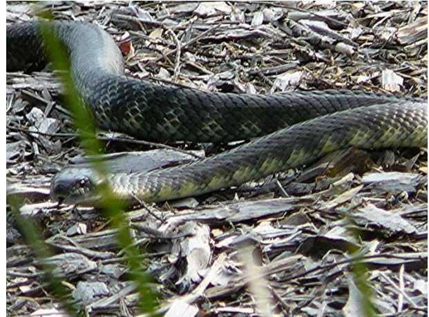
Figure 1. Tiger Snake

Tiger Snakes are often marked by a series of dark brown and yellow-brown bands, but they may or may not be present. Their underbelly is generally lighter than the main body and un-banded.