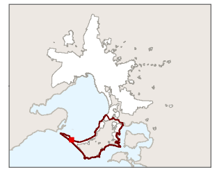
Part of Planning Scheme Maps 22HO & 23HO

Disclaimer This publication may be of assistance to you but the State of Victoria and its employees do not guarantee that the publication is without flaw of any kind or is wholly appropriate for your particular purposes and therefore disclaims all liability for any error, loss or other consequence which may arise from you relying on any information in this publication.