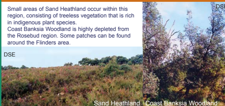
Sand Heathland Coast Banksia Woodland