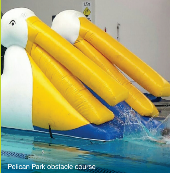
Pelican Park obstacle course